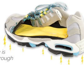
Static charge is dissipated through ESD insoles